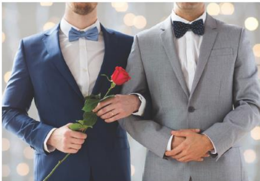
Le mariage pour tous ?